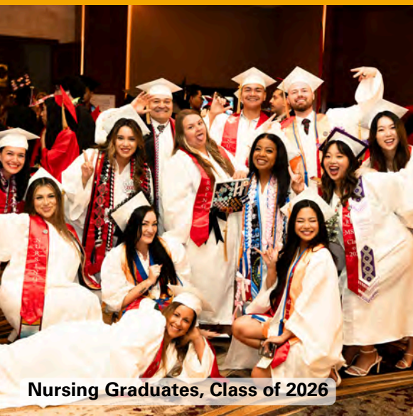
Nursing Graduates, Class of 2026