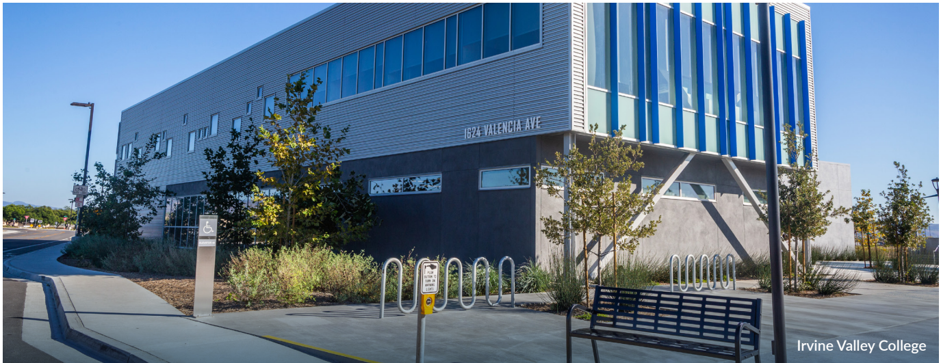
Irvine Valley College