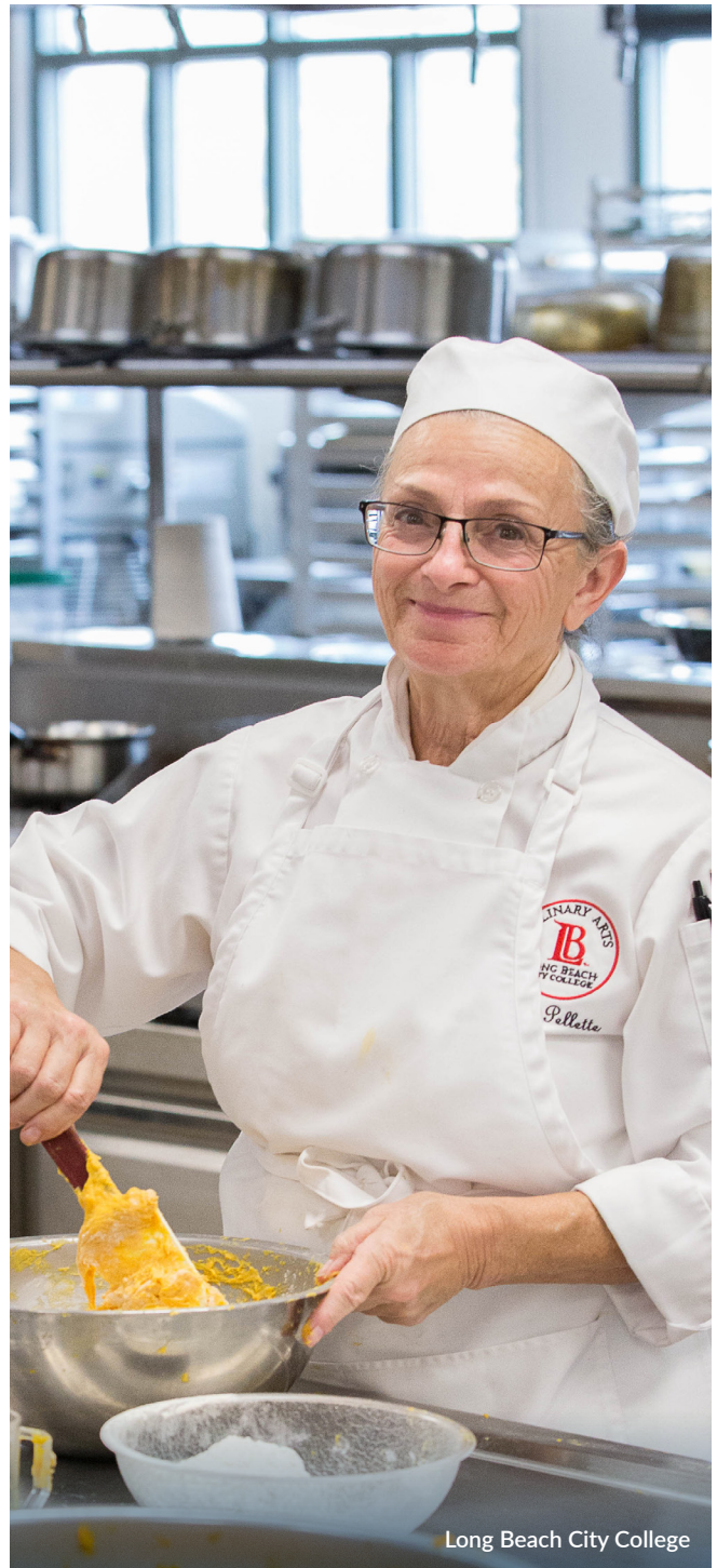
Long Beach City College

Most of the board tasks listed in this document refer to the board's policy role. "Policy" defines the general goals and acceptable practices for an institution. The board is responsible to discuss the general values and priorities that should be reflected in policy. The CEO and staff usually draft policy statements that incorporate these values and present them to the board for discussion and approval. The CEO also alerts the board about external factors that may require policy changes.