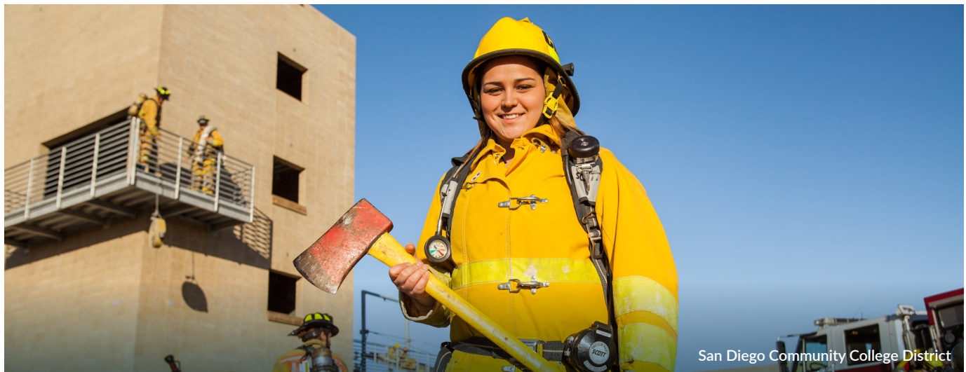
San Diego Community College District