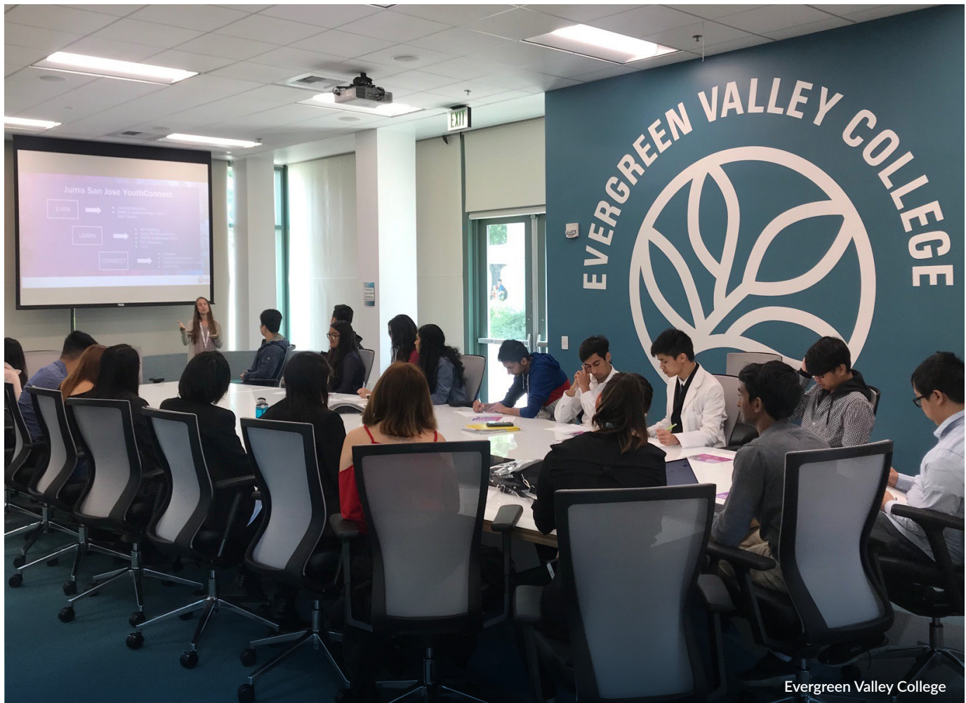
Evergreen Valley College