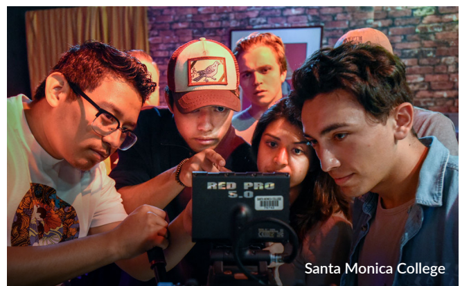
Santa Monica College

Community College League of California 2017 O Street, Sacramento, 95811