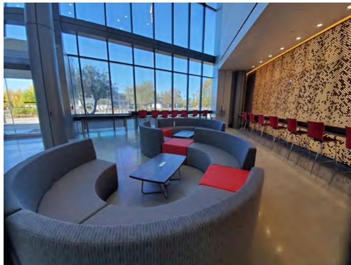
Tremecula Valley Campus