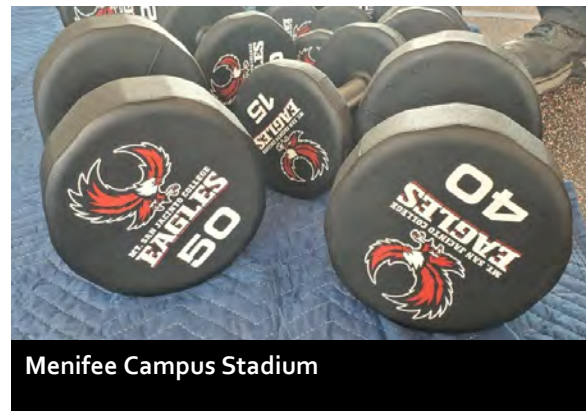
Menifee Campus Stadium