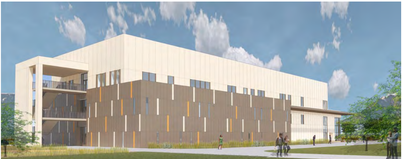
Rendering—San Jacinto Campus STEM Building

Chair, Independent Citizens' Oversight Committee