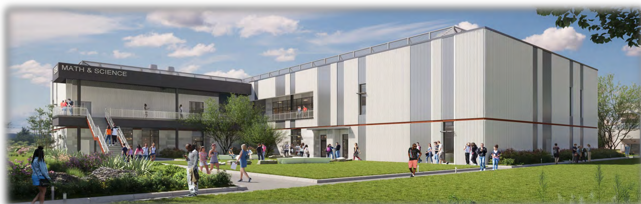
Rendering—Menifee Campus STEM Building